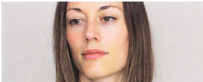
PROMS AT ... CADOGAN HALL 4 • 6 AUGUST