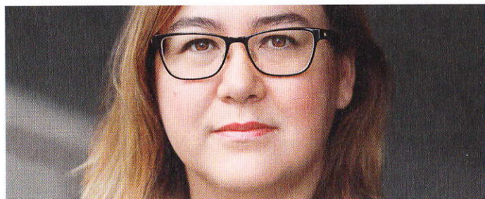
PROMS AT ... CADOGAN HALL 3 • 30 JULY