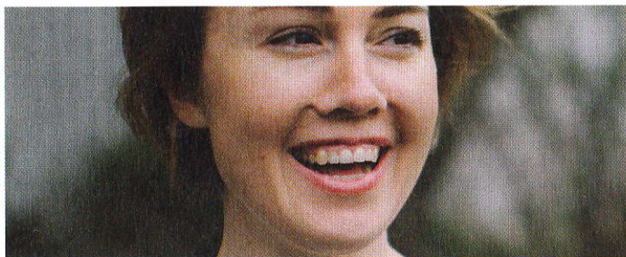
PROMS AT ... CADOGAN HALL 1 • 16 JULY

'I'm probably the worst person to try and describe my own music.' New York-based composer, vocalist and violinist Caroline Shaw – the youngest ever recipient of the Pulitzer Prize for Music, in 2013 for her Partita for 8 Voices – instead points to a whole range of things that inspire her. 'I'm in love with harmony, and that's what has always driven me to make music. I'm in love with radical switches from chaos to order. I love pacing, and organising, time – which I think is what some people call form. I love Buxtehude and [singer-songwriter and rapper] Childish Gambino, and Adele and Gérard Grisey.'